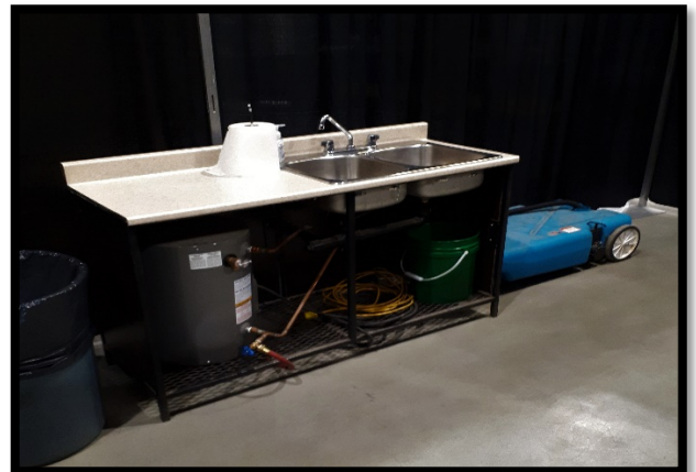
Booth and Temporary sink set up.