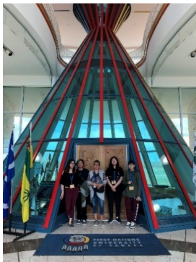
First Nations University of Canada Ceremonial Tipi

Organize or promote public activities and events that ensure the Capital City is a source of pride.