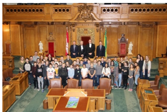
Students from Beechy, Eaton and Kyle, Saskatchewan