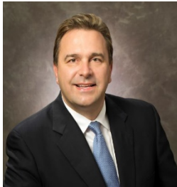
The Honourable Ken Cheveldayoff Minister Responsible for the Provincial Capital Commission

Office of the Lieutenant Governor of Saskatchewan.