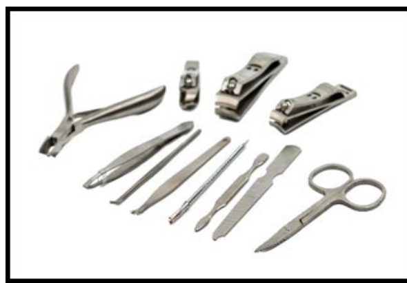
Pedicure Tools; Nail Tools