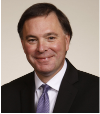
The Honourable Gordon S. Wyant, Q.C. Minister of Education

I am pleased to present the Ministry of Education Plan for 2019-20.