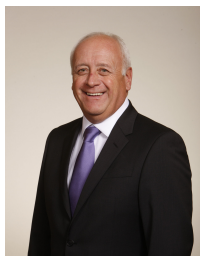
The Honourable David Maritz Minister of Agriculture

I am pleased to present the Ministry of Agriculture's Operational Plan for 2019-20.