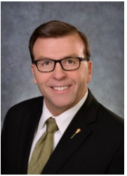
The Honourable Greg Ottenbreit

The goal for the health system in 2019-20 is to better connect people with the right care in the right setting whether in physician offices, in the community, or in health system facilities.