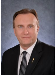
The Honourable Jim Reiter