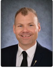
The Honourable Dustin Duncan