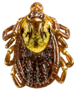
American dog tick

Blacklegged (deer) ticks can carry Lyme and other diseases.